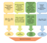
Figure 3 Mechanisms of action of herbal...